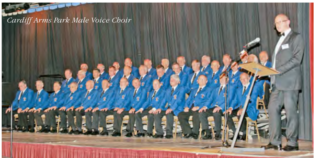
Cardiff Arms Park Male Voice Choir